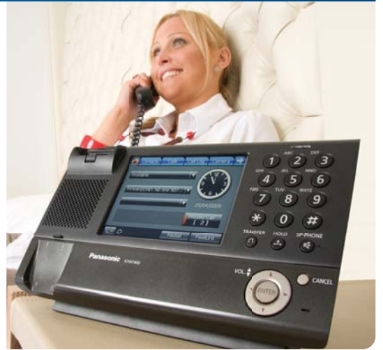
KX-NT400 EXECUTIVE IP TELEPHONE BROCHURE