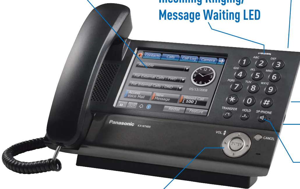
Easy Navigation Key